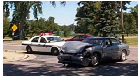
Practice car control, don't let something like this happen to you.

Practice, practice, practice. By developing these lifetime skills, we also improve our chances for a longer life..