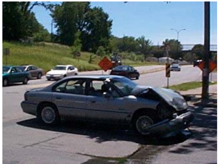
Two tons of metal traveling at speed can do a lot of damage. Driving is serious business that requires both book knowledge and car handling skill

Book knowledge can help us here but practice